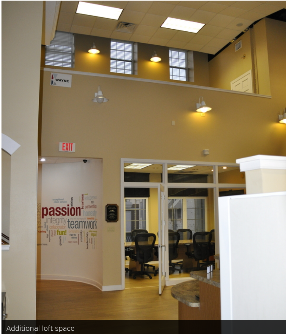
Additional loft space