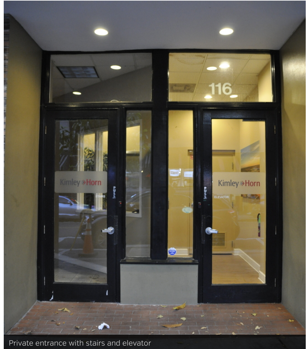
Private entrance with stairs and elevator