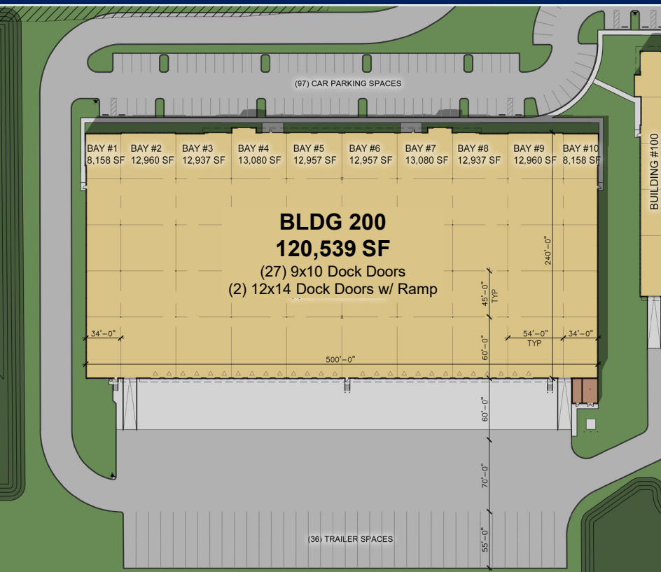
Building 200 | 120,539 SF