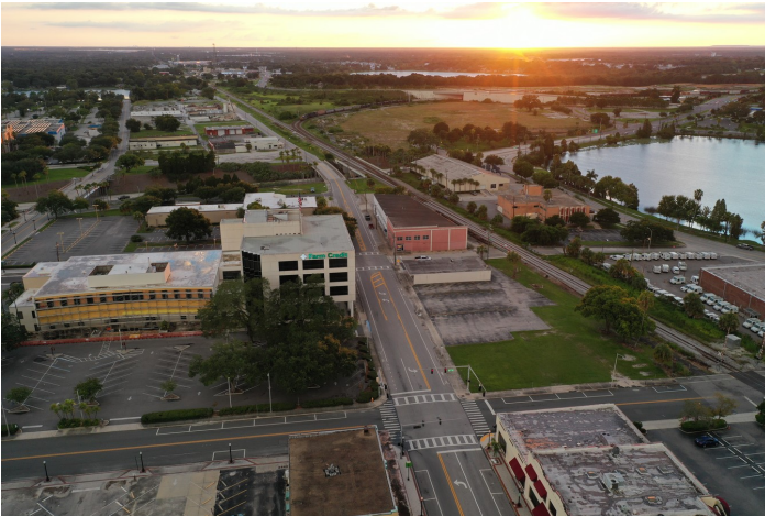
115 S Missouri Ave 4