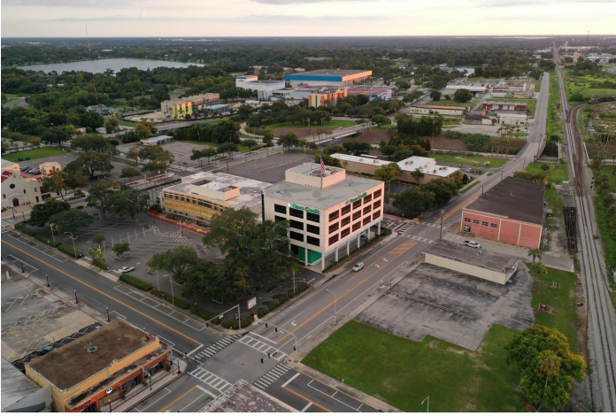
115 S Missouri Ave 7