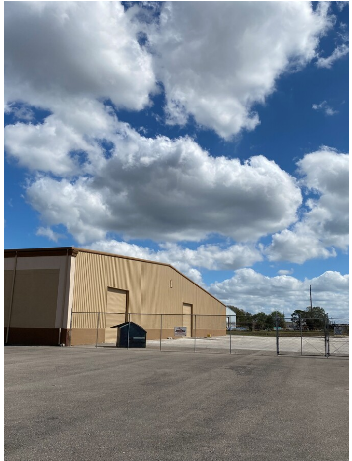
Photo Back Yard & Drive in Doors