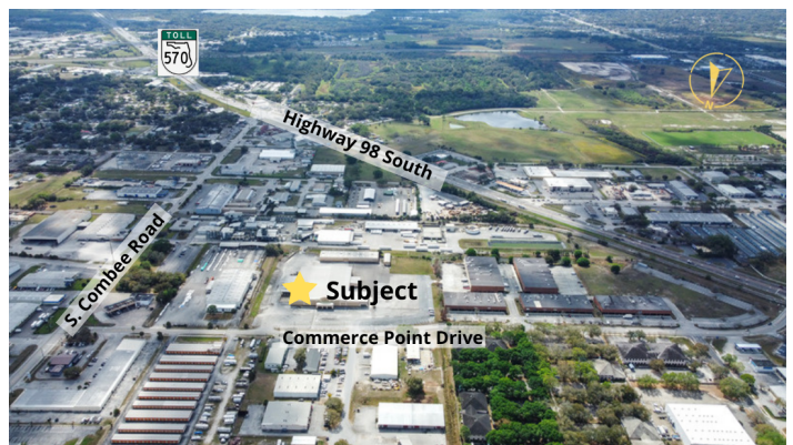
Aerial Photo SW