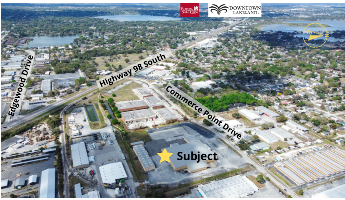
Aerial Photo NW