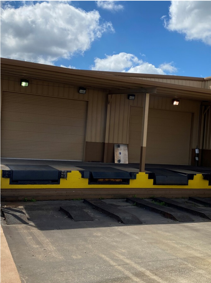
Loading Dock-4 truck positions